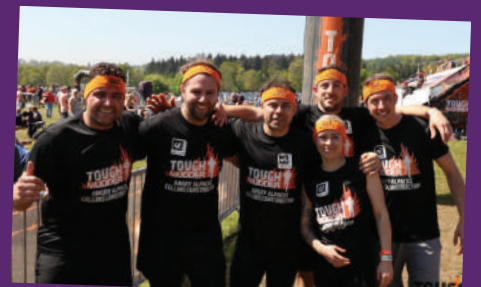
Collins Construction, 182 HH Tough Mudder Team