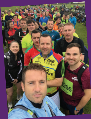
Lorclon's Achill Quest