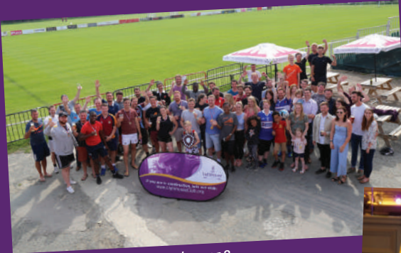
Laing O'Rourke Tag Rugby 2018

Across the country, organisations just like yours have pledged to hold a Lighthouse Day, ranging from summer balls, tough mudder challenges, site BBQs, football tournaments and even teams of people skydiving to raise much needed money for our charity! It really doesn't matter how small the amount raised is, every pound will make a huge difference to our work helping our construction families in need and most importantly, you can have some great fun whilst supporting a fantastic cause!