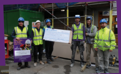
Edgewater Contracts Coffee Morning