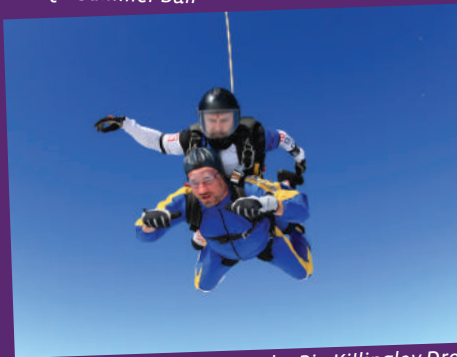
The Big Killingley Drop