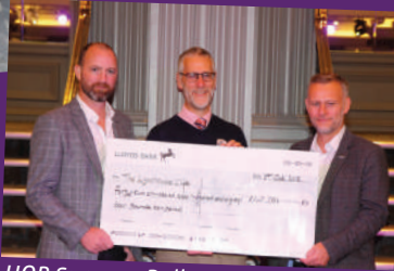
HQR Summer Ball