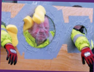
Moray Fun and Safety Day