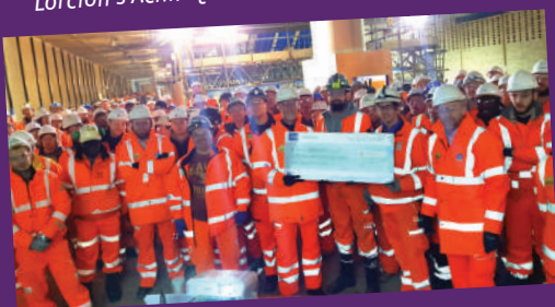
Costain-Skanska JV Paddington