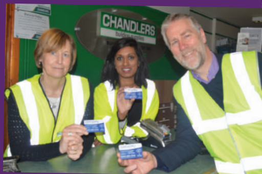
Chandlers Building Supplies Lighthouse Year