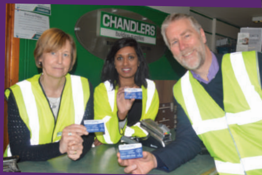
Chandlers Building Supplies Lighthouse Year