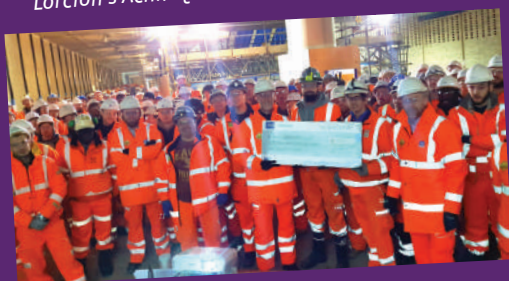
Costain-Skanska JV Paddington