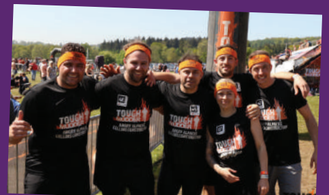
Collins Construction, 182 HH Tough Mudder Team