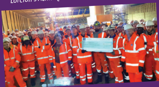
Costain-Skanska JV Paddington