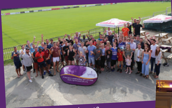
Laing O'Rourke Tag Rugby 2018

Across the country, organisations just like yours have pledged to hold a Lighthouse Day, ranging from summer balls, tough mudder challenges, site BBQs, football tournaments and even teams of people skydiving to raise much needed money for our charity! It really doesn't matter how small the amount raised is, every pound will make a huge difference to our work helping our construction families in need and most importantly, you can have some great fun whilst supporting a fantastic cause!