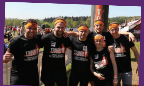
Collins Construction, 182 HH Tough Mudder Team