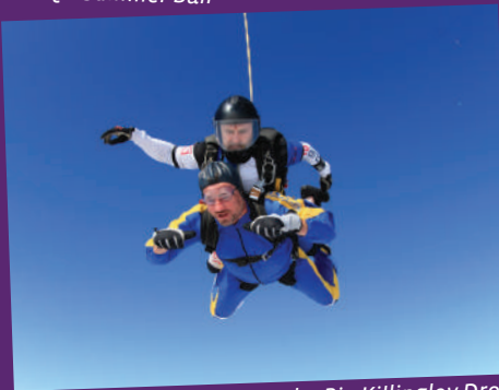
The Big Killingley Drop