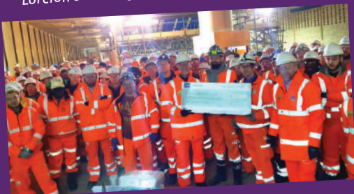
Costain-Skanska JV Paddington