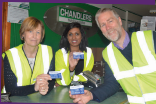
Chandlers Building Supplies Lighthouse Year